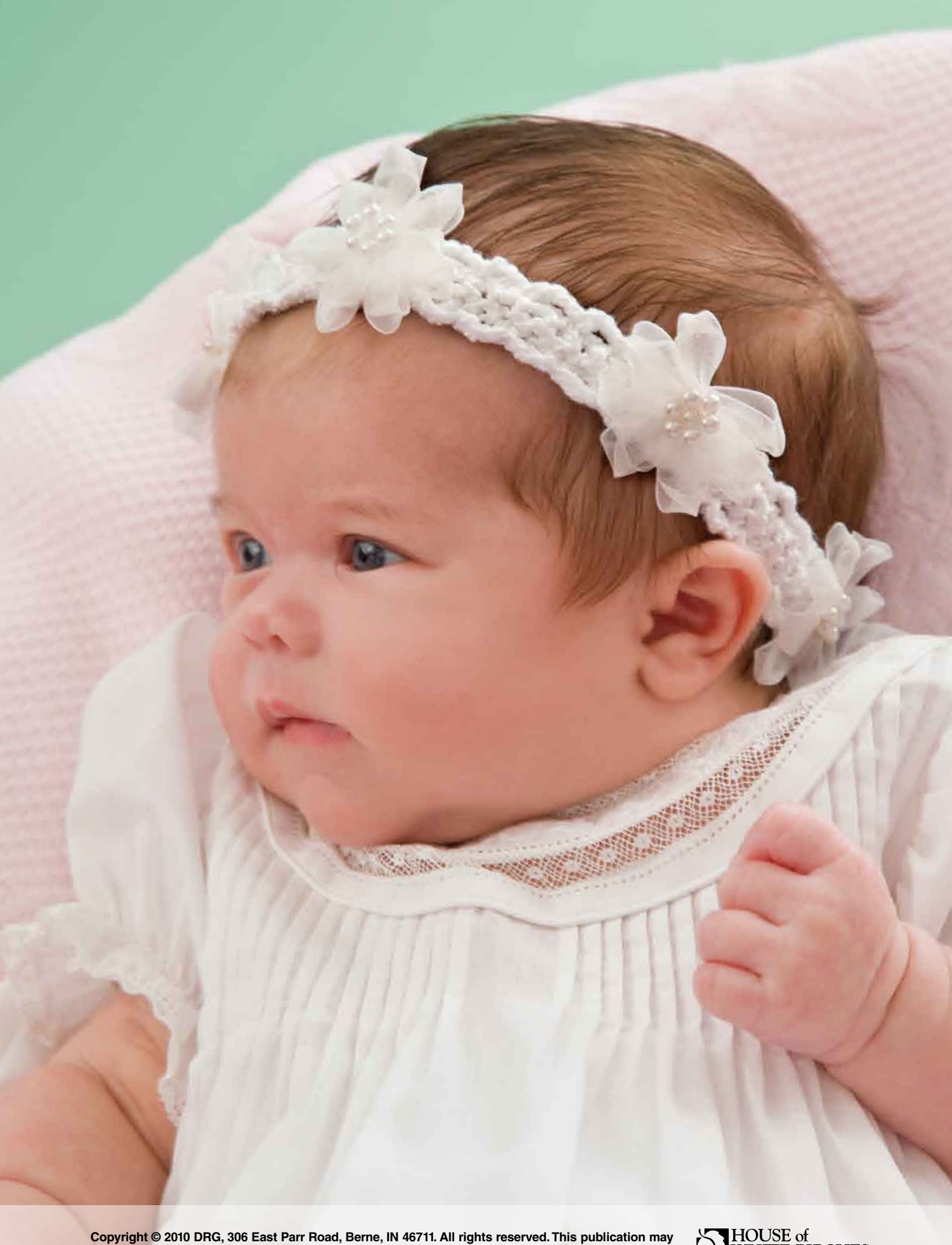
not be reproduced or transmitted in part or in whole without written permission from the publisher.